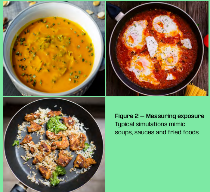
Figure 2 – Measuring exposure Typical simulations mimic soups, sauces and fried foods

Using the general exposure approach, almost all PA66 utensils are far above the 5 mg/kg food. BfR also uses the S/V approach to come to a specific exposure for the article. Using this approach, 70% of the tested PA66 articles comply and only the articles with a high S/V, such as ladles and spoons have a migration above the 5 mg/kg food.