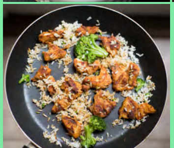
Figure 2 — Measuring exposure Typical simulations mimic soups, sauces and fried foods