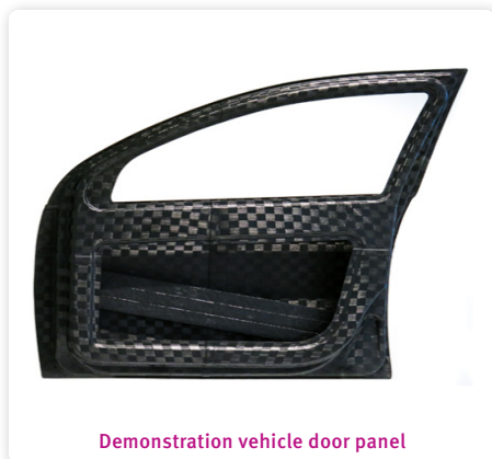
Demonstration vehicle door panel

DSM's polyamide-based UD tapes with endless carbon or glass fiber reinforcements are viable, lightweight alternatives to metals in several applications. UD tapes, tape-based 2D fabrics and crossplies are used in structural and semi-structural applications, as well as in the selective reinforcement of injection molded parts .