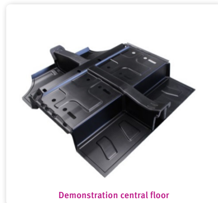
Demonstration central floor

Maxion Wheels and DSM successfully manufactured and tested (Rim Rolling Fatigue) thin-walled hybrid, steel-composite automotive wheel-rim reinforced with UD tape (tape-winding) made from glass fiber-reinforced PA410. The hybrid wheel-rim is 2Kg lighter and 30% more fatigue-resistant than state-of-the-art, steel design, whilst inert to road salts and battery acids.