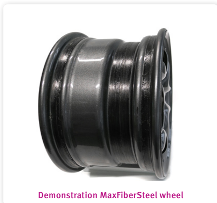
Demonstration MaxFiberSteel wheel

A demonstration vehicle door panel made by JLR from carbon fiber-reinforced PA410, as well as fabric sheets woven from the same UD tape (EU-sponsored ENLIGHT project). The UD tape products were thermo-formed and glued to make the panel, which is 60% lighter than state-of-the-art, steel-based designs, while still fulfilling safety requirements. The full composite door consists of structural panels and a tape-wound side impact beam over an extruded, permanent mandrel.